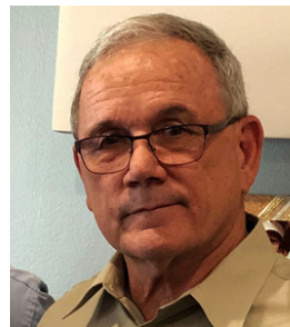
De Ron Jones Club Championship